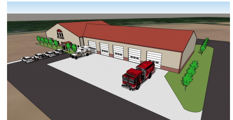
3D Conceptual Drawing of Berne Township Fire Department